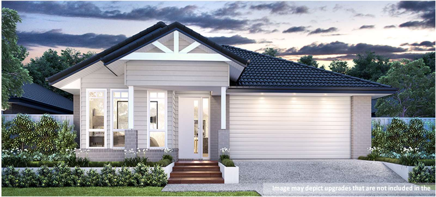
Image may depict upgrades that are not included in the

Floor area: 259.36m 2 / 27.92sq | Block Size: 560.1m 2 Address: Lot 1037 Harvest Drive, Banyan Hill, Ballina, NSW