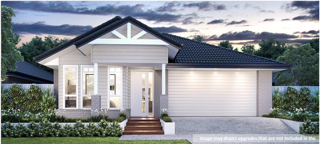
Image may depict upgrades that are not included in the

Floor area: 222.32m 2 / 23.93sq | Block Size:552.6m 2 Address:Lot 158 Tumbarumba Way Forster Grange