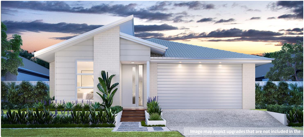
Image may depict upgrades that are not included in the

Floor area: 222.32m 2 / 23.93sq | Block Size: 601.5m 2 Address: Lot 142 Akala Avenue Forster Grange