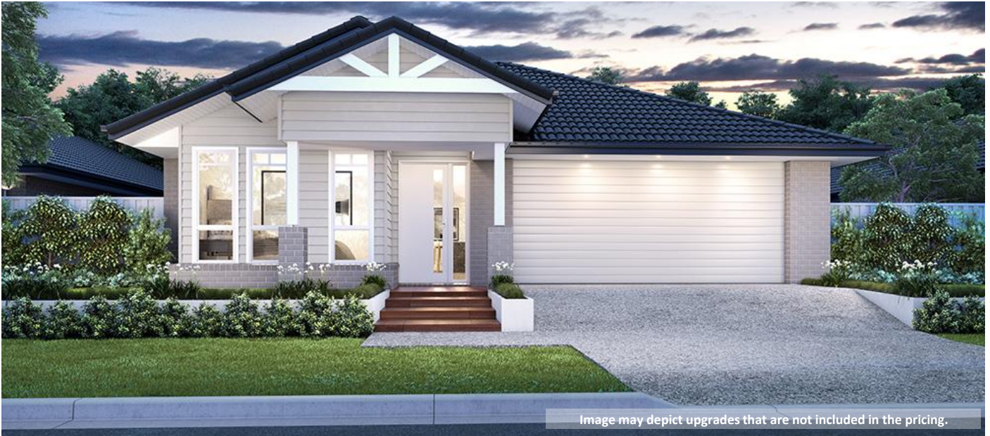
Image may depict upgrades that are not included in the pricing.

Floor area: 212.89m 2 / 22.92sq | Block Size: 970m 2 Address: Lot 813 Yeomans Road, Armidale 2350