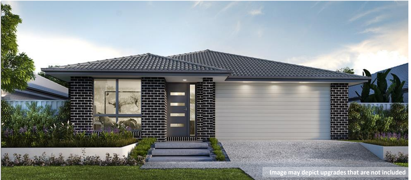
Image may depict upgrades that are not included

Floor area: 222.32m 2 / 23.93sq | Block Size: 802m 2 Address: 1/21 ROSEWOOD AVENUE, CASINO NSW