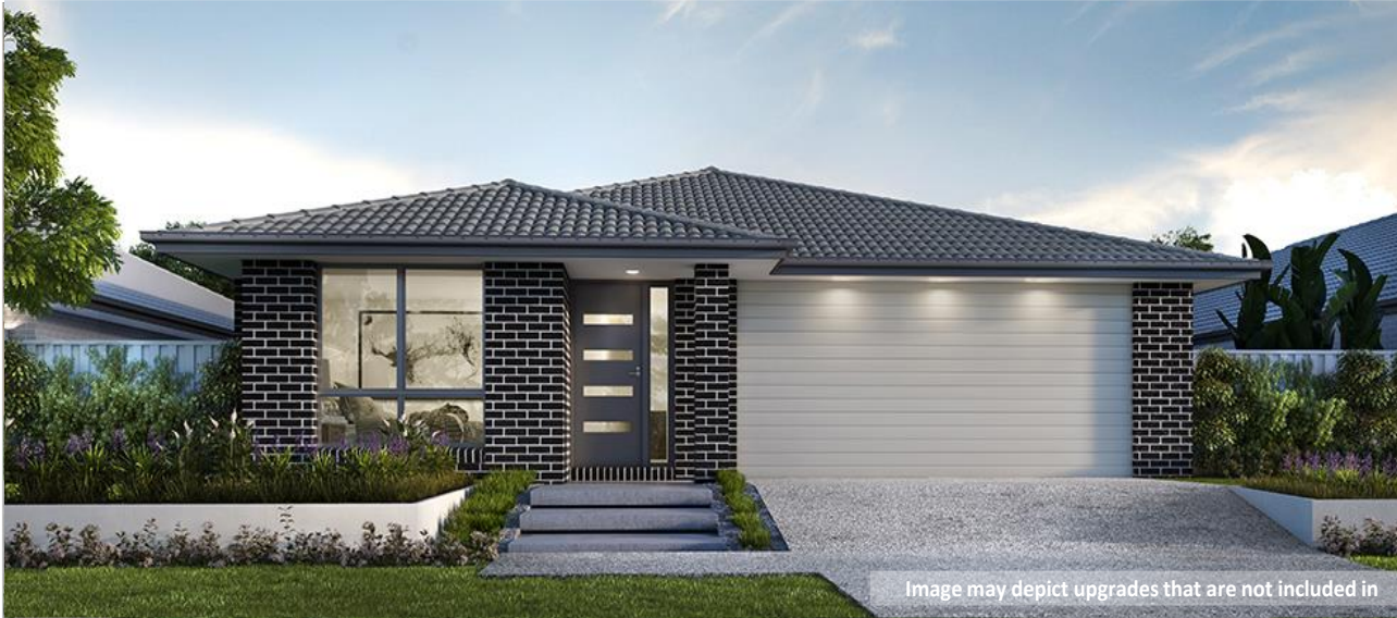
Image may depict upgrades that are not included in

Floor area: 196.25m 2 / 21.12sq | Block Size: 587m 2 Address: Lot 2 Yamaan Road, Nambucca Heads