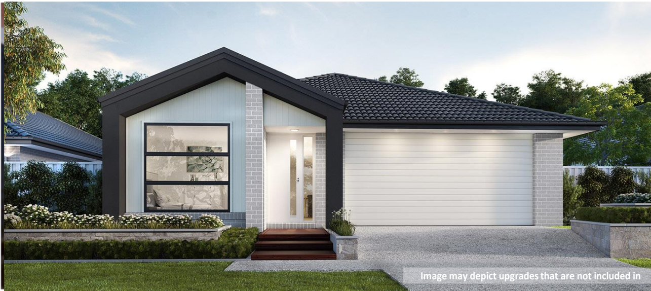
Image may depict upgrades that are not included in

Floor area: 204.54m 2 / 22.02sq | Block Size: 593m 2 Address: Lot 150 Lophostemon Dr, North Boambee Valley