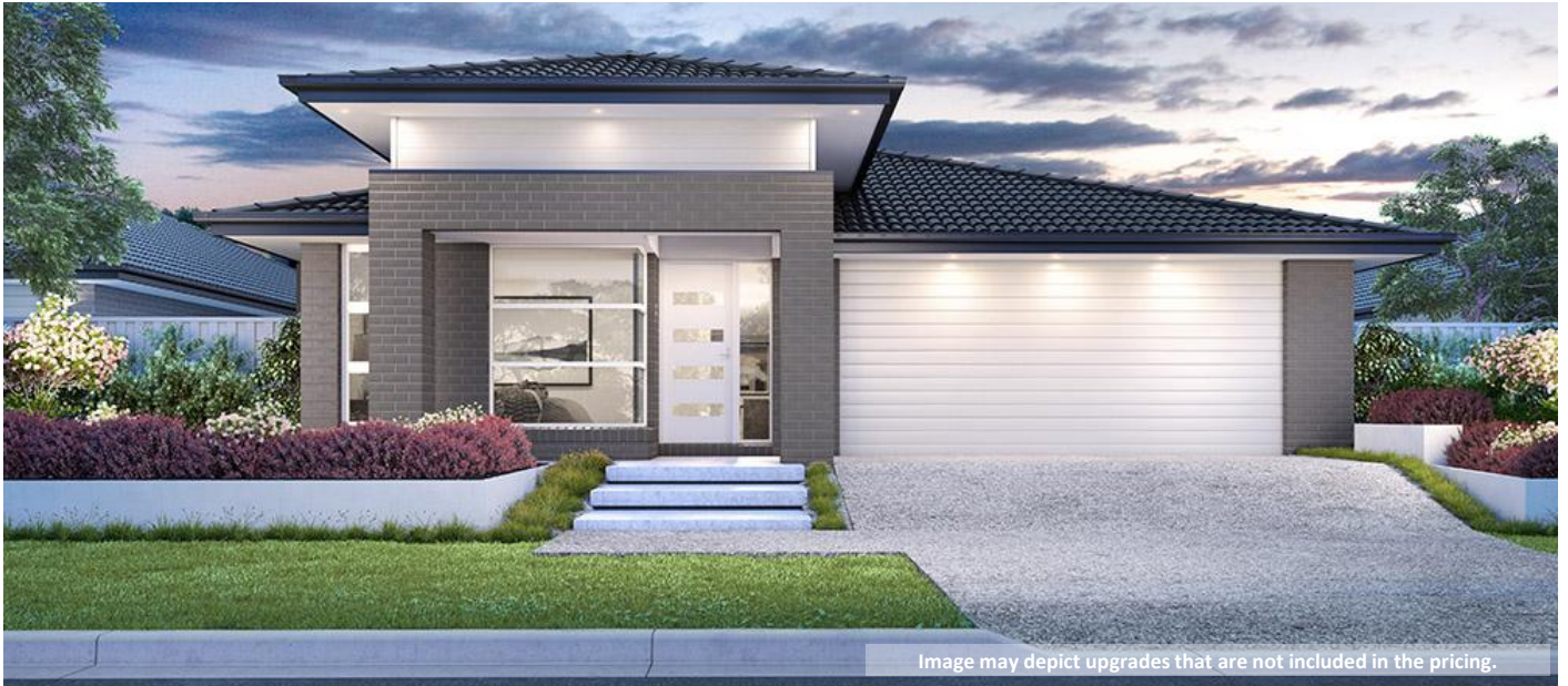
Image may depict upgrades that are not included in the pricing.

Floor area: 240.94m 2 / 25.94sq | Block Size: 680m 2 Address: Lot 116 Bushel Street, Cookes Hill Estate, Armidale