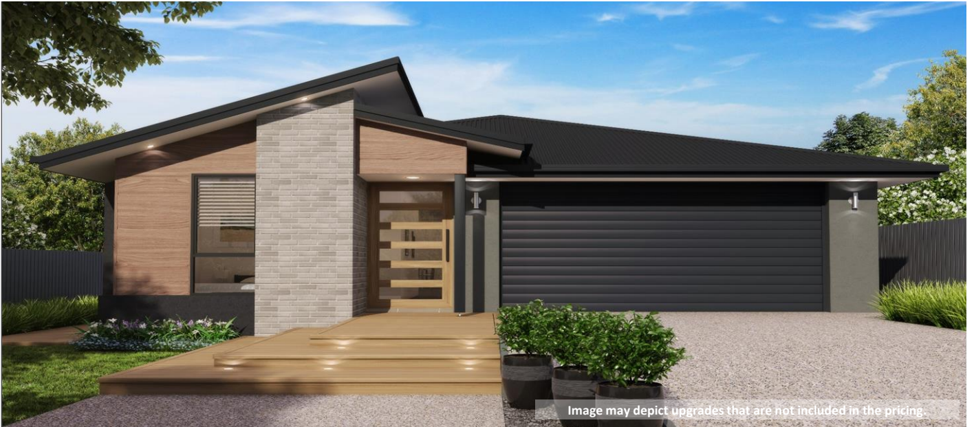
Image may depict upgrades that are not included in the pricing.

Floor area: 222.32m 2 / 23.93sq | Block Size: 622m 2 Address: Lot 123 Wurinda Drive, Macksville NSW