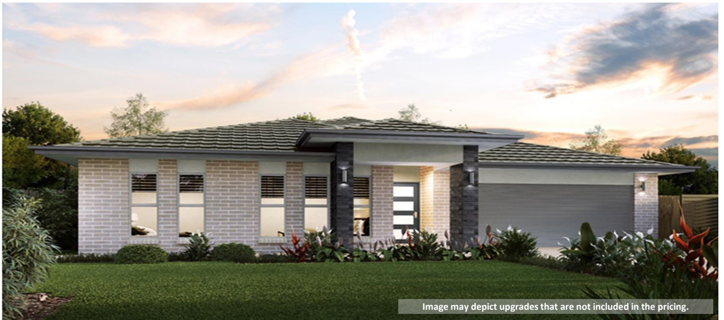
Image may depict upgrades that are not included in the pricing.

Floor area: 285.35m 2 / 30.72sq | Block size: 1514m 2 Address: Lot 327 Ossa Street, Louth Park