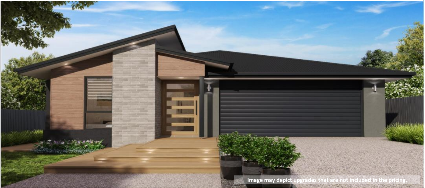
Image may depict upgrades that are not included in the pricing.

Floor area: 222.32m 2 / 23.93sq | Block size: 586m 2 m 2 Address: Lot 426 Ernest Drive Banyan Hill NSW 2478